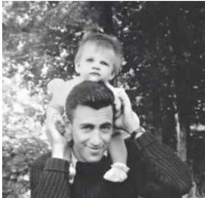
J. D. Salinger, 1919-2010